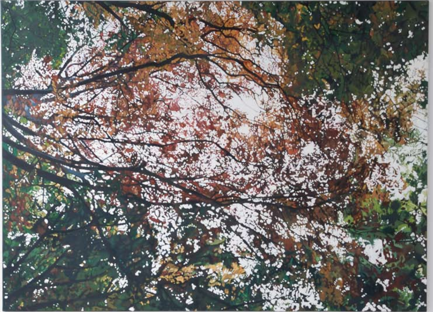
Lichträume I, 2007