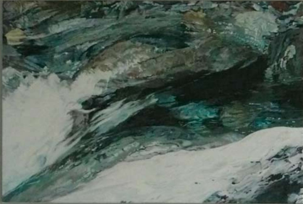
right: Eiswasser II, 2008, oil on canvas, 135 x 202 x 3 cm left: Eiswasser IV, 2009, oil on canvas, 135 x 202 x 3 cm