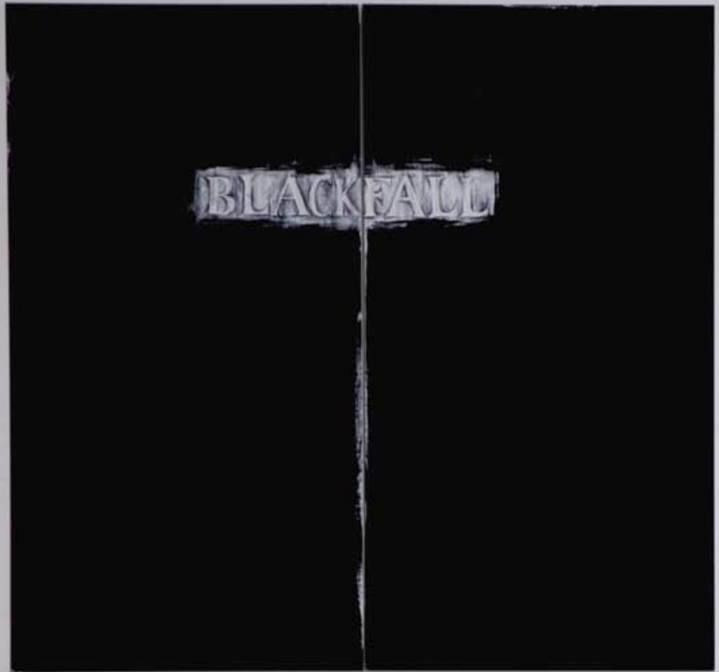
left: Black Fall, 2009 right: White Sentenced, 2009