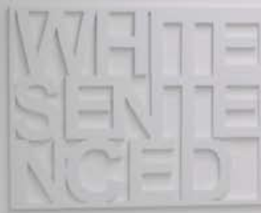
clockwise: Black Fall, 2009 White Sentenced, 2009 Stay In Body, 2009 Gaze Monologue, 2009 Heaven Ropes End, 2009