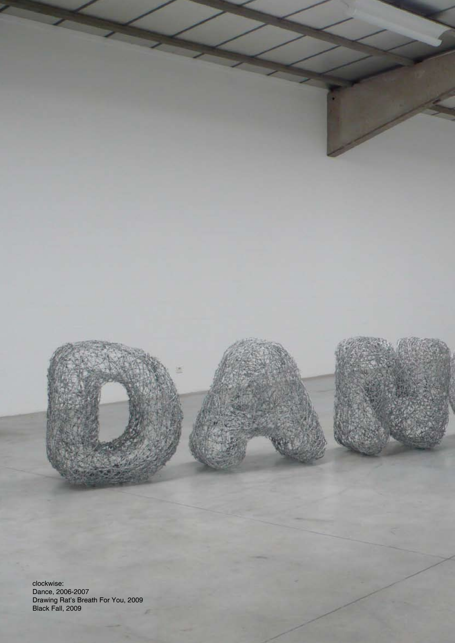
clockwise: Dance, 2006-2007 Drawing Rat's Breath For You, 2009 Black Fall, 2009