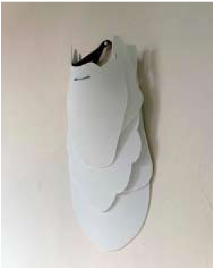
Stefaan Dheedene, Pitch-ad-Toss (2008), laquered metal and laminated wood, 480 x 150 x 120 cm (socle 220 x 150 x 60 cm) (digital design sketch) Stefaan Dheedene, Stencil Set ( Marx, Darwin, Santa, King Leopold II, Gandalf ) (2008), neoprene, edition 7+IAP, h60 cm approx