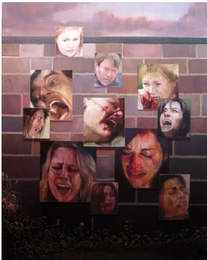
Benjamin Moravec, Happy Together - Mourir Ensemble , 2008, oil on canvas, 252 x 412 cm Benjamin Moravec, Absurde , 2008 oil on canvas, 300 x 240 cm